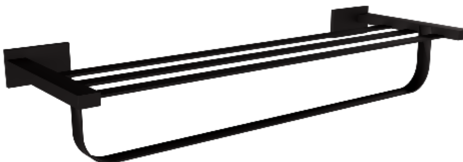
Code : MB-49075 Towel Rack 24" MRP-₹ 13500/-