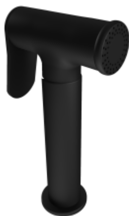
Code : MB-ALD-939 Health Faucet MRP - ₹ 3622/-