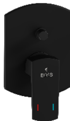
Code : MB-915049K Exposed Kit for High Flow MRP - ₹ 4025/- Code : MB-49 Concealed Body High Flow MRP - ₹ 5749/-