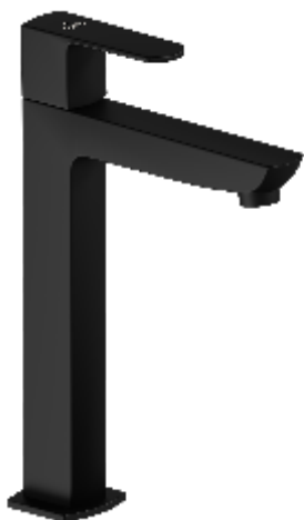
Code : MB-911019 Pillar Cock Extended Body MRP - ₹ 6210/-