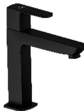
Code : MB-911011 Pillar Cock MRP - ₹ 4082/-