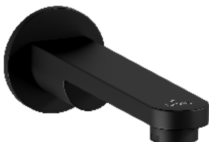
Code : MB-89060 Bath Tub Spout with Flange MRP - ₹ 3392/-