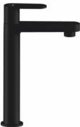
Code : MB-49019 Pillar Cock Extended Body MRP - ₹ 4887/-