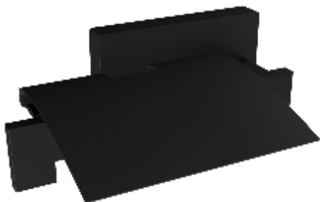
Code : MB-49007 Toilet Paper Holder with Flap MRP-₹ 3200/-