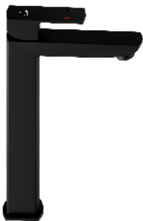
Code : MB-915030 Single Lever Basin Mixer Extended Body MRP - ₹ 12200/-