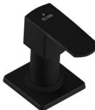
Code : MB-913652 Exposed Part for CSC (Suitable for ALD-0136 and ALD-0152) MRP - ₹ 1495/-