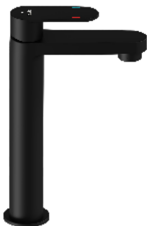
Code : MB-49030 Single Lever Basin Mixer Extended Body MRP - ₹ 10120/-