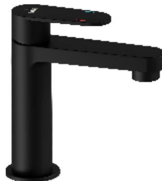
Code : MB-49015 Single Lever Basin Mixer MRP - ₹ 8337/-