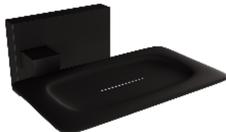
Code : MB-49009 Soap Dish Full Brass MRP-₹ 3200/-