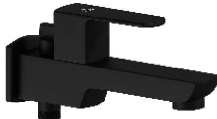
Code : MB-911089 Two Way Bib Cock MRP - ₹ 4427/-