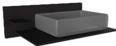
Code : MB-49003 Soap Dish MRP-₹ 2760/-