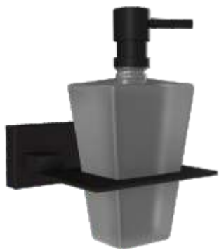
Code : MB-49400 Liquid Soap Dispenser MRP-₹ 3800/-