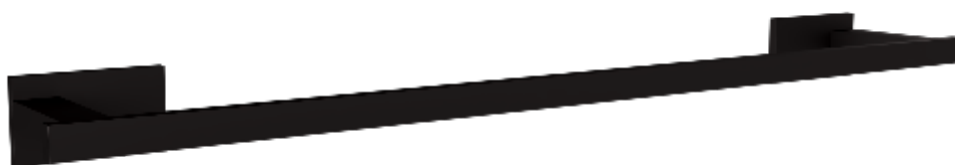
Code : MB-49001 Towel Rail 24" MRP-₹ 4900/-