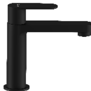
Code : MB-49011 Pillar Cock MRP - ₹ 3507/-