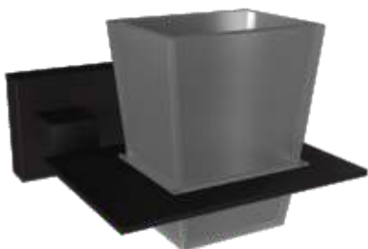
Code : MB-49004 Tumbler Holder with Glass MRP-₹ 2760/-