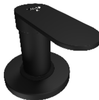
Code : MB-493652 Exposed Part for CSC (Suitable for ALD-0136 and ALD-0152) MRP - ₹ 1380/-