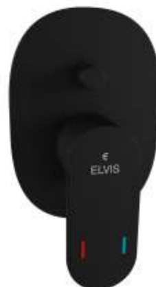
Code : MB-49049K Exposed Kit for High Flow MRP - ₹ 4168/- Code : MB-49 Concealed Body High Flow MRP - ₹ 5749/-