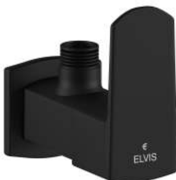
Code : MB-911103 Angle Cock MRP - ₹ 2760/-