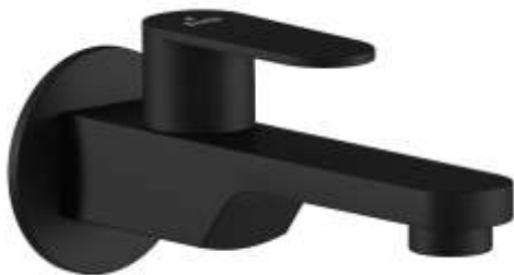
Code : MB-49049 Bib Cock MRP - ₹ 3392/-