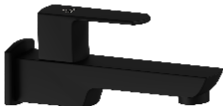
Code : MB-911049 Bib Cock MRP - ₹ 3622/-