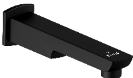
Code : MB-911060 Bath Tub Spout with Flange MRP - ₹ 3737/-