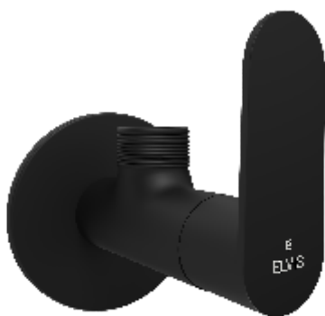
Code : MB-49103 Angle Cock MRP - ₹ 1955/-