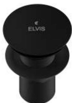
Code : MB-ALD -011 Pop up Waste MRP - ₹ 2702/-