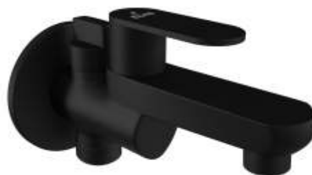
Code : MB-49089 Two Way Bib Cock MRP - ₹ 3795/-