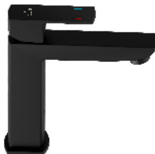
Code : MB-915015 Single Lever Basin Mixer MRP - ₹ 9750/-